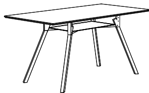
Trio dining table 1500W x 900D x 740H Ref: OLTRDT